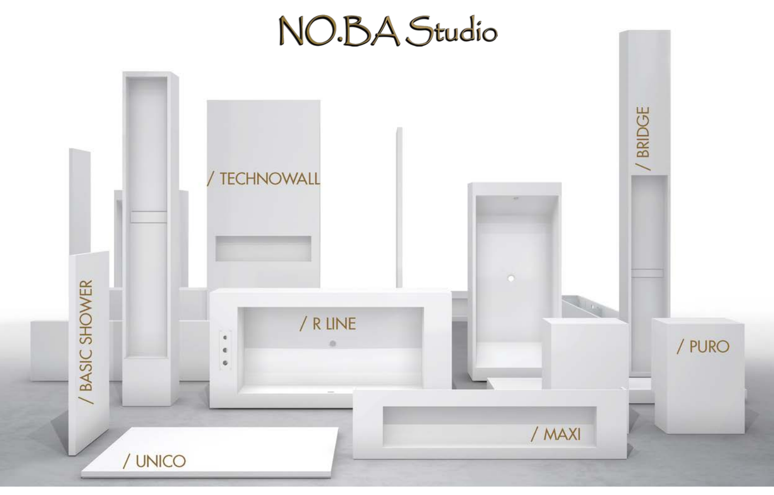
THERE IS A GREAT SELECTION OF OPTIONS FOR FURTHER FINISHING WHICH CAN ALSO BE ORDERED AS A PRE-CUT WHICH ONLY NEEDS TO BE GLUED AFTER INSTALLATION.